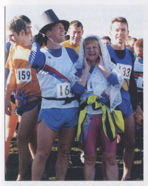
The happy couple