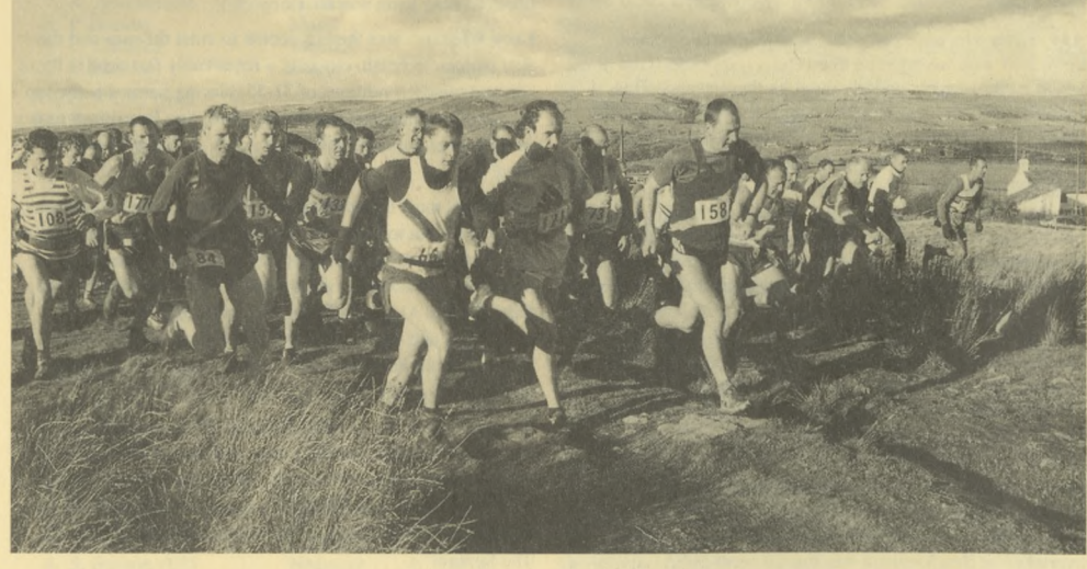
Start of Shepherds Skyline