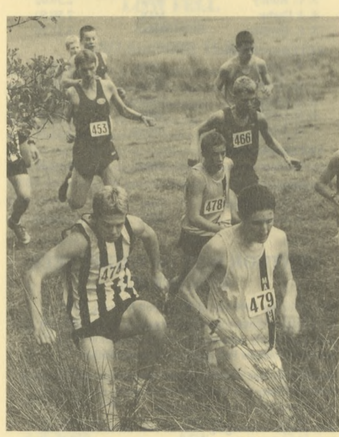
Thieveley Pike junior starters