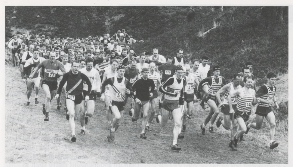
537 runners seeing out the old year.