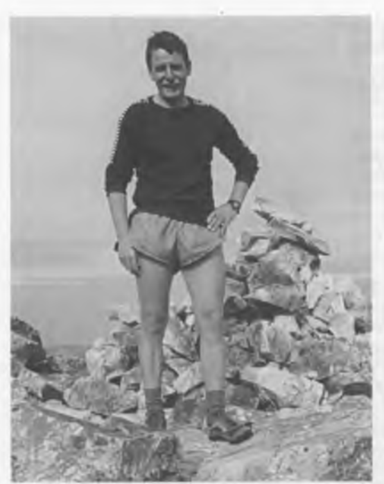
On top of Glenshee Pass