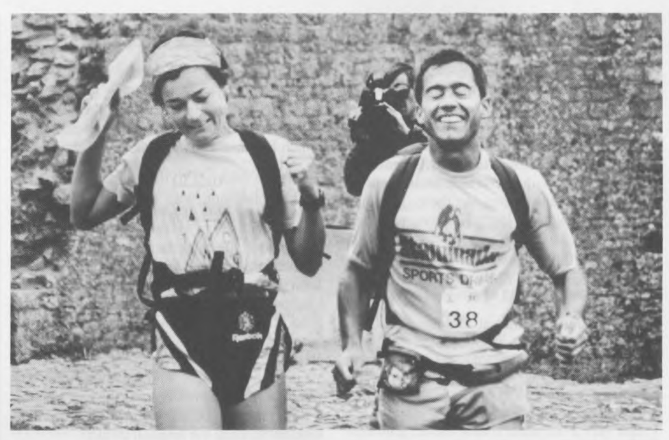
The Moment of Victory!

Day 3 saw us visiting Cadair Idris and Pumlumon via all the scenic country in between. This was potentially one of the hardest days with a combination of rough terrain, long distances and high hills. As it was, the skies were clear, the weather kind and we even saw Red Kites.