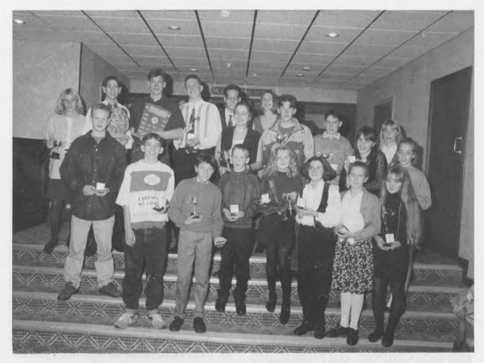
Junior prizewinners at the FRA dinner.