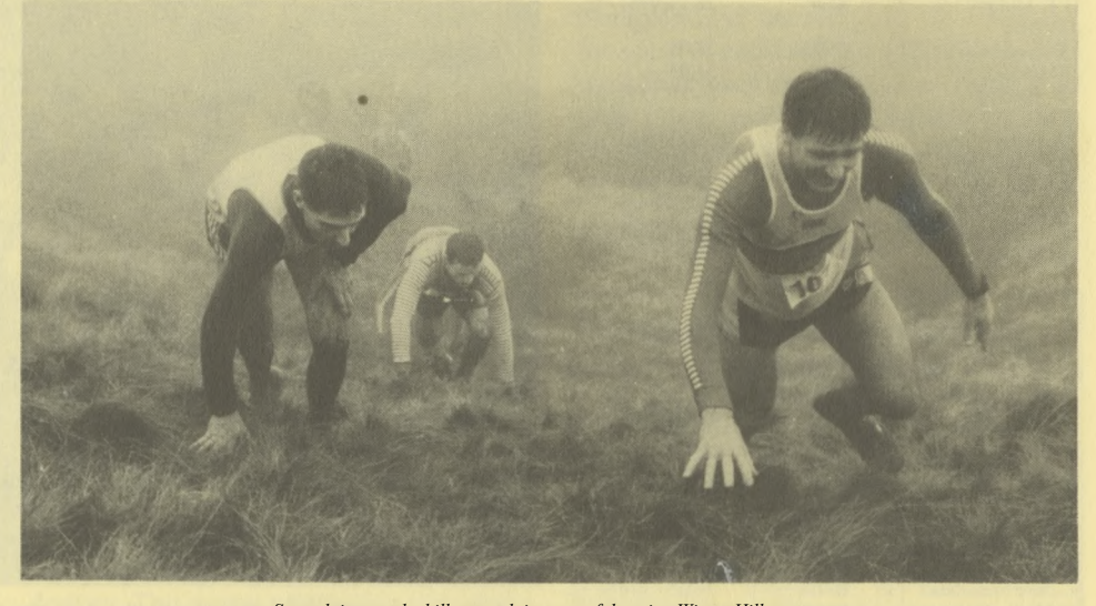
Second time up the hill, second time out of the mist; Winter Hill.