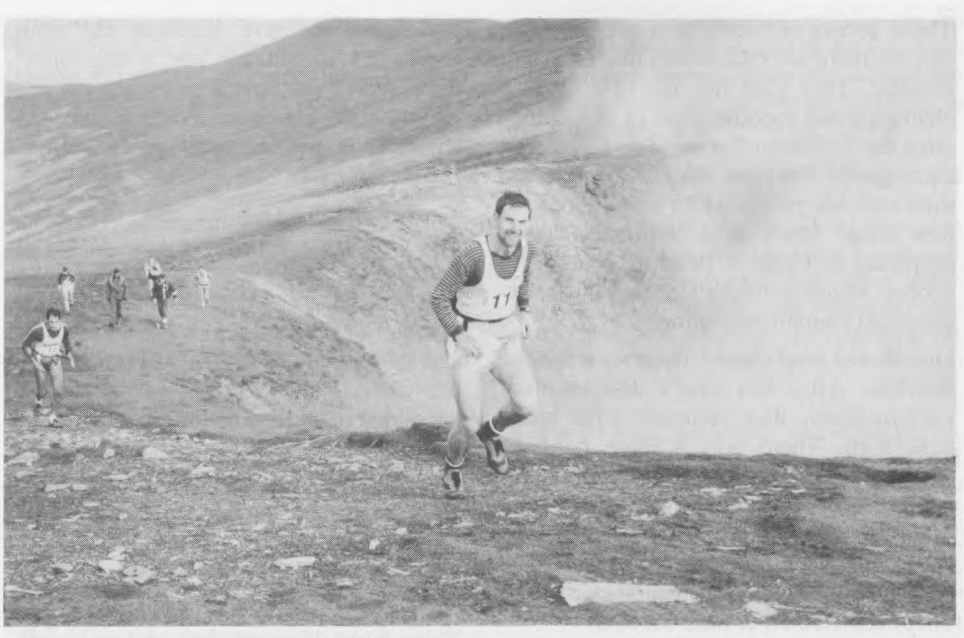
Teamwork - On top of a misty Blencathra in the FRA Relay