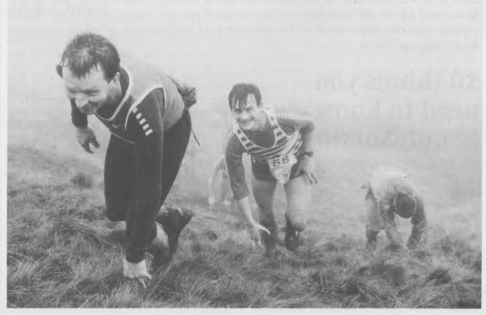
A real winter ridge.... runners ascending Winter Hill for the second time.