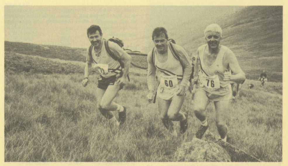
Still smiling at the start of the Wasdale before the weather closed in