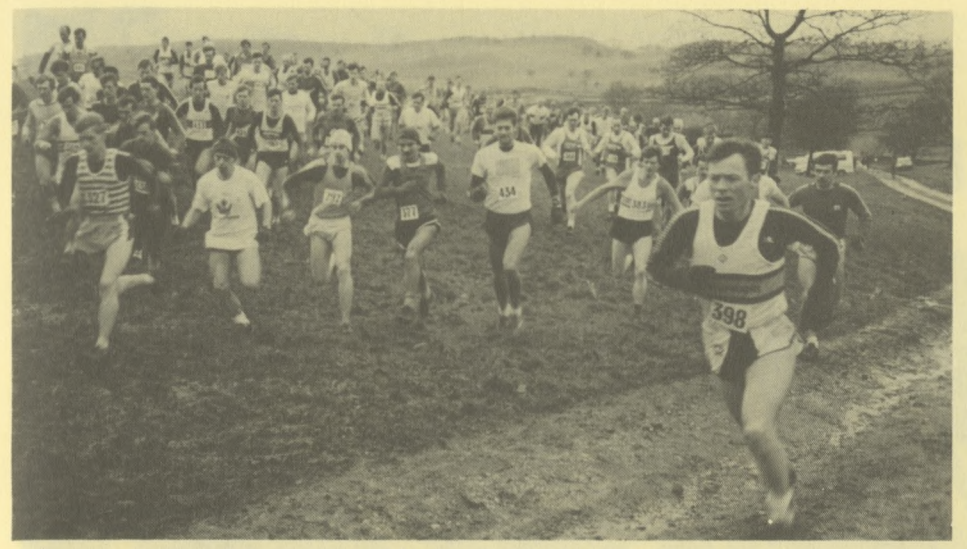
Rombalds Moor - just after the start.