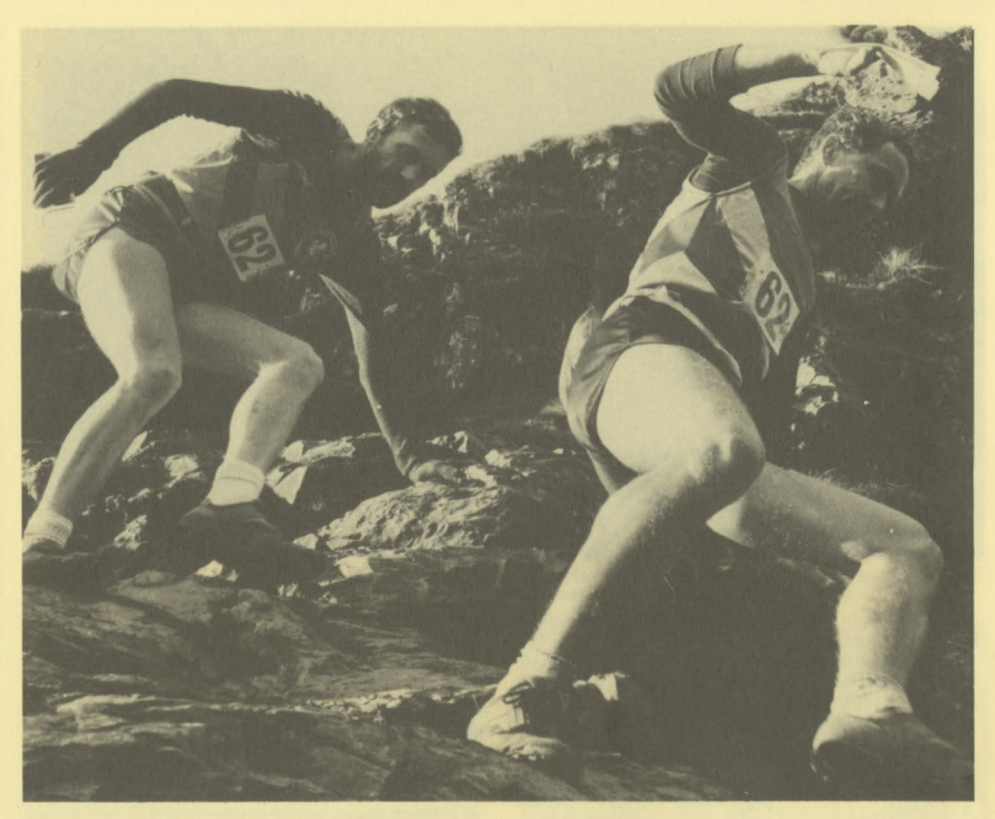
Macclesfield runners negotiate leg 2 of the FRA relay.